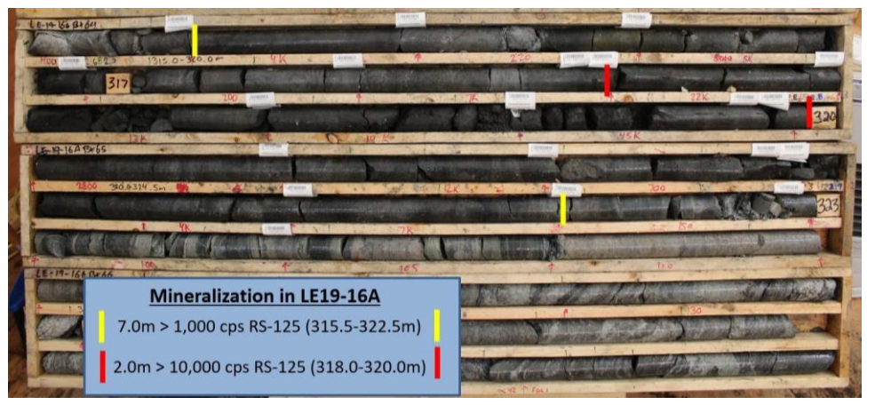
Figure 3: Hole LE19-16A Mineralized Core