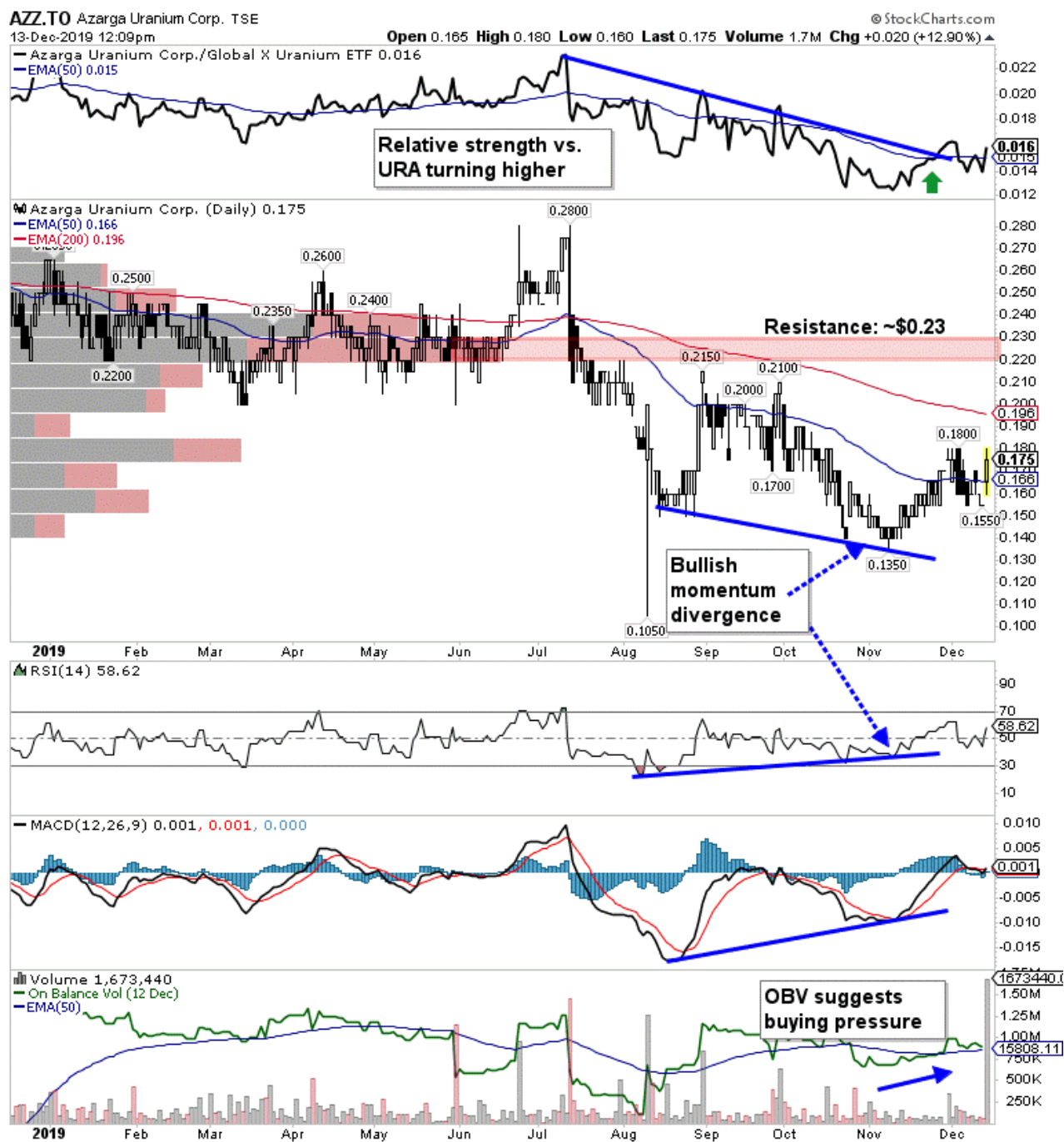
Source: Haywood Securities Inc., Stockcharts.com