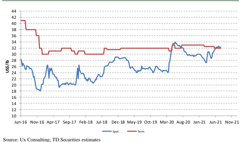
Exhibit 1. Spot and Term Uranium Prices

In previous quarters, management has indicated that "it continues to have a large volume of off-market discussions with utilities regarding additional contracting activity". This quarter, the wording changed to "negotiations continue on the business opportunities remaining in our pipeline", which sounds a little less optimistic about the pace of future contracting activity. However, management clarified on its conference call that it expects to continue a high level of contracting activity.